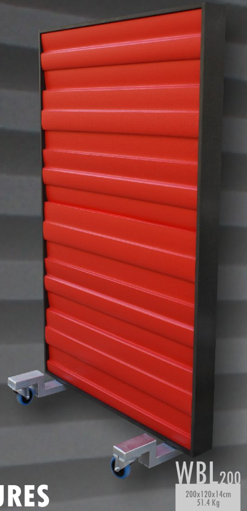
WBL200 200x120x14cm 51.4 Kg