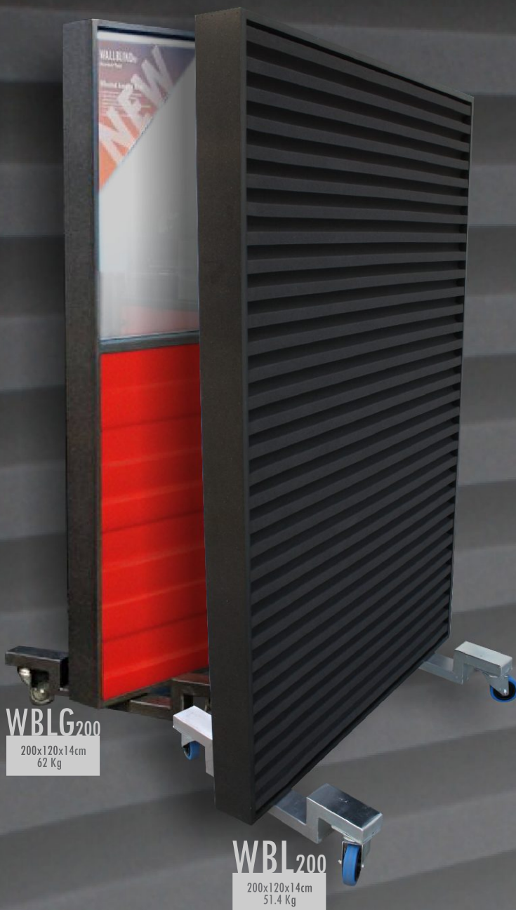
WBLG200 200x120x14cm 62 Kg