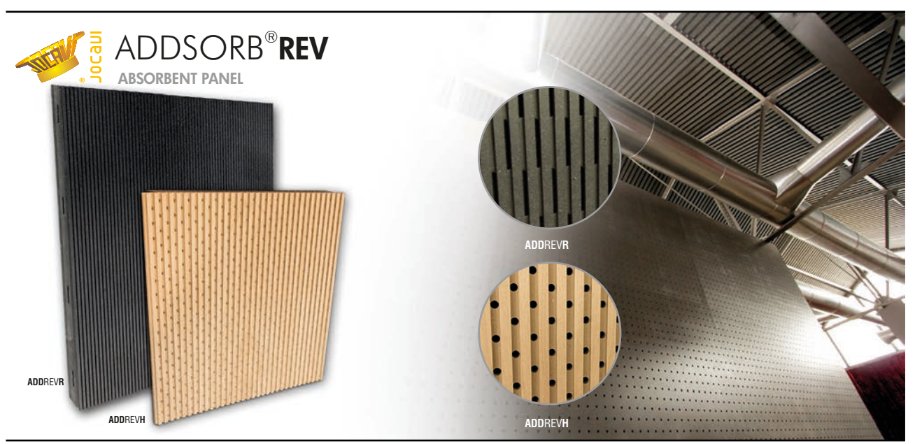
Image of Addsorb® REV models Ref.:ADRV colour and Ref.:ADRH wood (on the left) and Ref.:ADRH colour (ambient image)