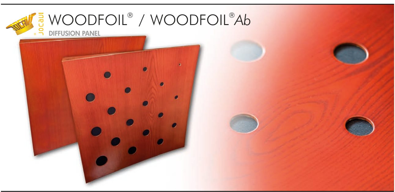
Image of 60x60cm models Ref.:WFL060 and WFL060Ab (on the left) and 60cm Ref.:WFL060Ab (ambient image).