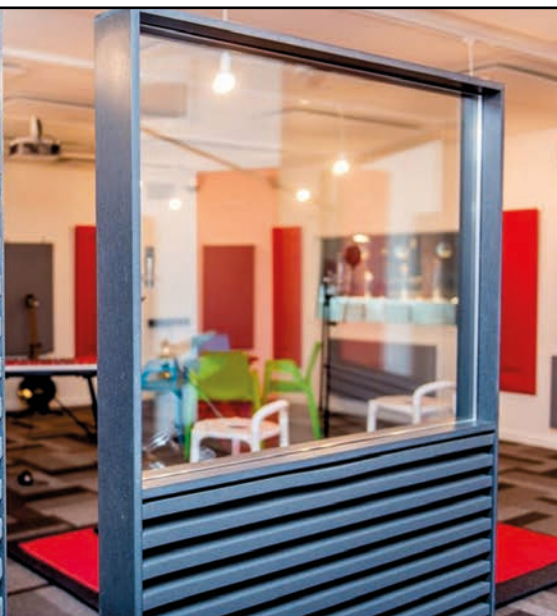
Image of 200x120cm models Ref.:WBLG200 and WBL200 (on the left) and Ref.:WBLG200 (ambient image).