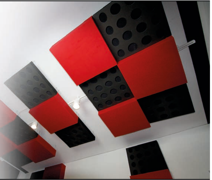
Image of 60x60cm model Ref.:WAL060 (on the left) and Ref.:WAL060 (ambient image).