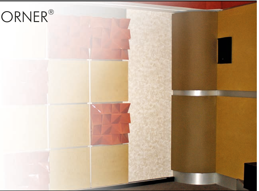
Image of 120x50cm model Ref.:RC0120 (on the left) and Ref.:RC0120 (ambient image).