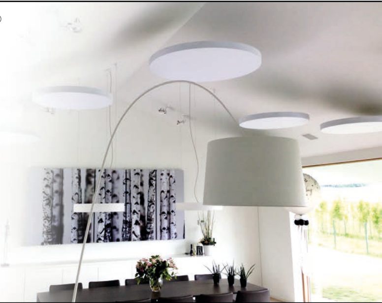
Image of 180x90cm, of the new 90x90cm cloud shape, the 90cm circular panel and 90x30cm model Ref.:LIG180, LIGC090, LIGR090 and LIG030 (on the left) and Ref.:LIGR090 model applied (ambient image).